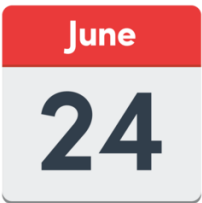
Tuesday 24 th June