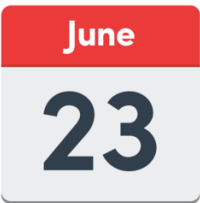
Monday 23 rd June