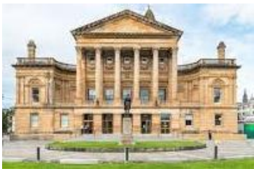
Paisley Town Hall