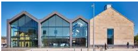
Johnstone Town Hall