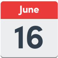
Monday 16 th June