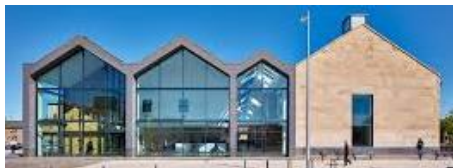
Johnstone Town Hall