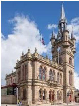
Renfrew Town Hall