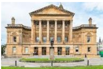
Paisley Town Hall