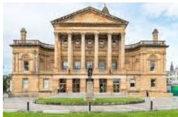
Paisley Town Hall