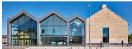
Johnstone Town Hall